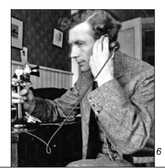
About 1910: A doctor on the phone