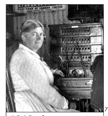
1919: An operator at a switchboard